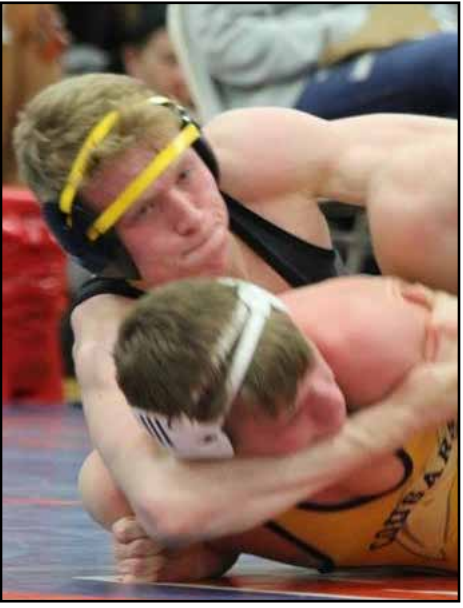
at districts this past Saturday. We are very proud of these guys as they left it all on the mat and that's what we as coaches ask them to do."