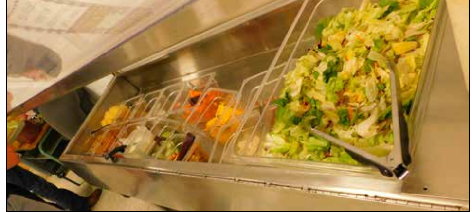
Students and staff can now enjoy the salad bar as yet another lunch option.