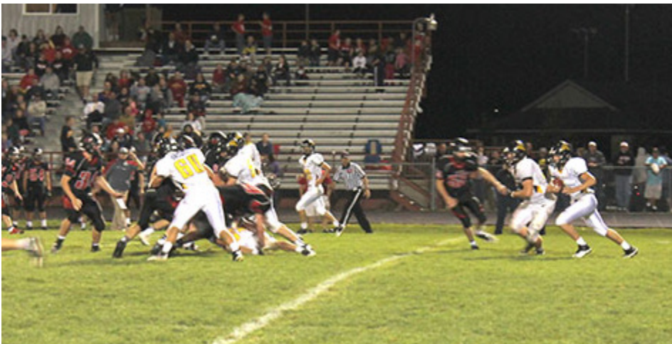
Above: The Wildcats' quarterback Jeremy Fischer picks up some rushing yards on a beautiful Friday night under the lights in Monticello.

Tonight the Cats host East Buchanan for Pack the Stands night.