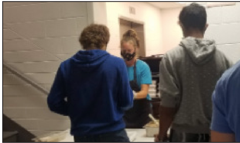
Juniors pick up lunch at the lower hallway.

We can see that there is good and bad in the new schedule, but one effect of Covid that most students love is the new lunch period. Meals are served in to-go bags with disposable containers. Students may eat outside (weather-permitting), in the gym, in classrooms with teacher permission or in select areas of the cafeteria. Just this week, MV families learned that all breakfasts and lunches will be free until Dec. 31 or when funds run out.