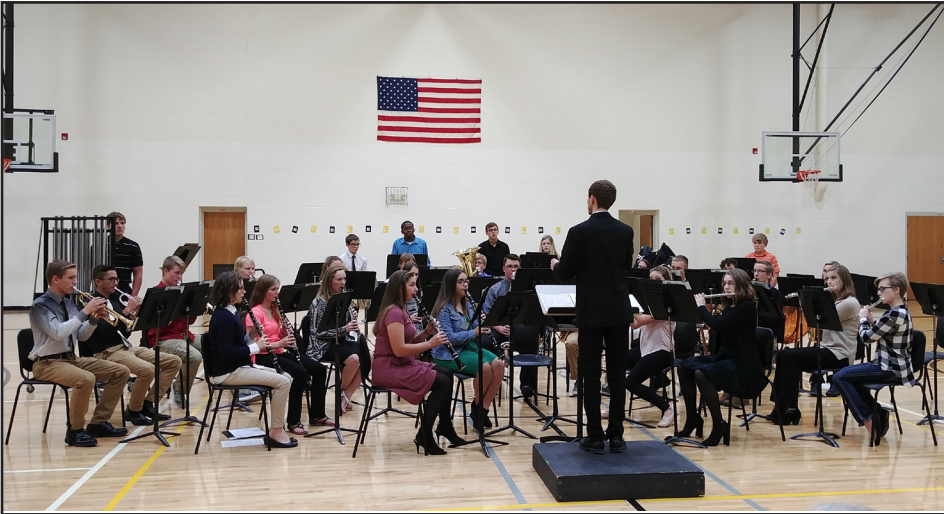
Concert band season has begun! The high school band along with the fifth, sixth, and junior high band shared their musical talents Tuesday evening at their fall concert.