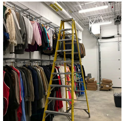
Progress has been made on the drama storage room and the weight room.