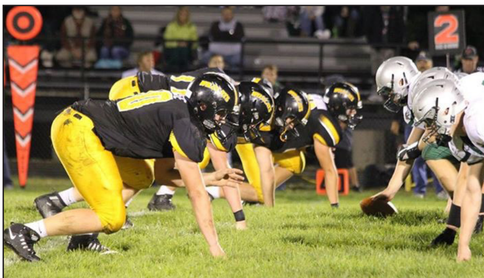
The defensive line gets set against Clayton Ridge last Friday night. MV's defense held the Eagles to 14 points.

Moral of the story: Be ready to use the toilet paper for your own messes.