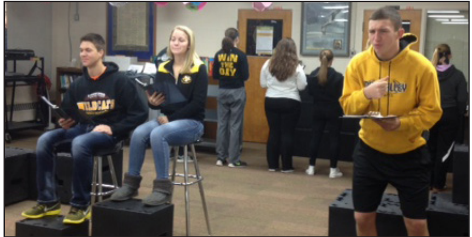
Members of the varsity readers theatre rehearse prior to conference contest.