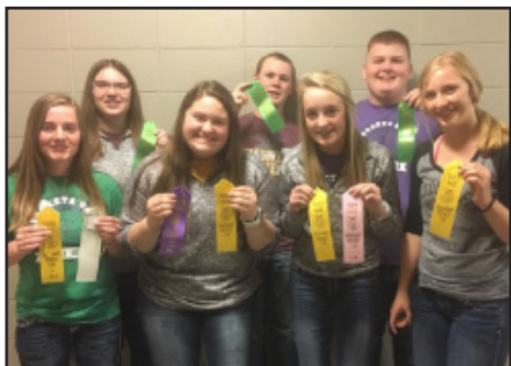
The food science teams pose with their ribbons.