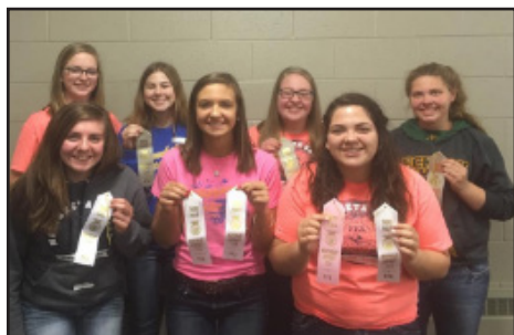
The floriculture teams pose with their ribbons.