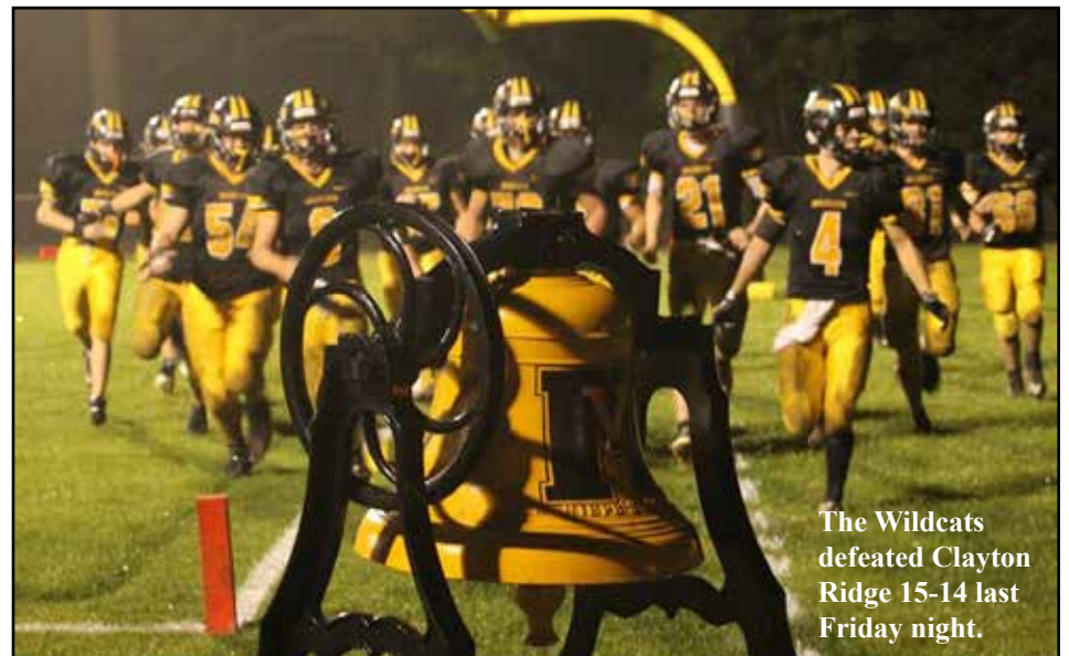
The Wildcats defeated Clayton Ridge 15-14 last Friday night.