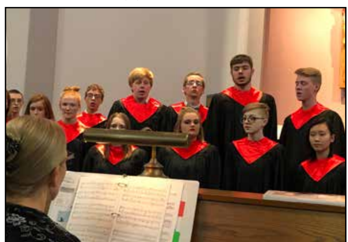
Fans of MV choir and band filled St. John's church to listen to the students' musical talent Monday night.