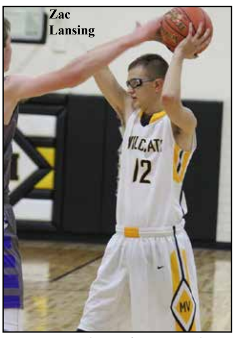
The boys team is on a four game winning streak as they earned victories over Cedar Valley Christian 61-34, Lisbon 50-47 and East Buchanan 47-44. MV hosts North Linn tonight.