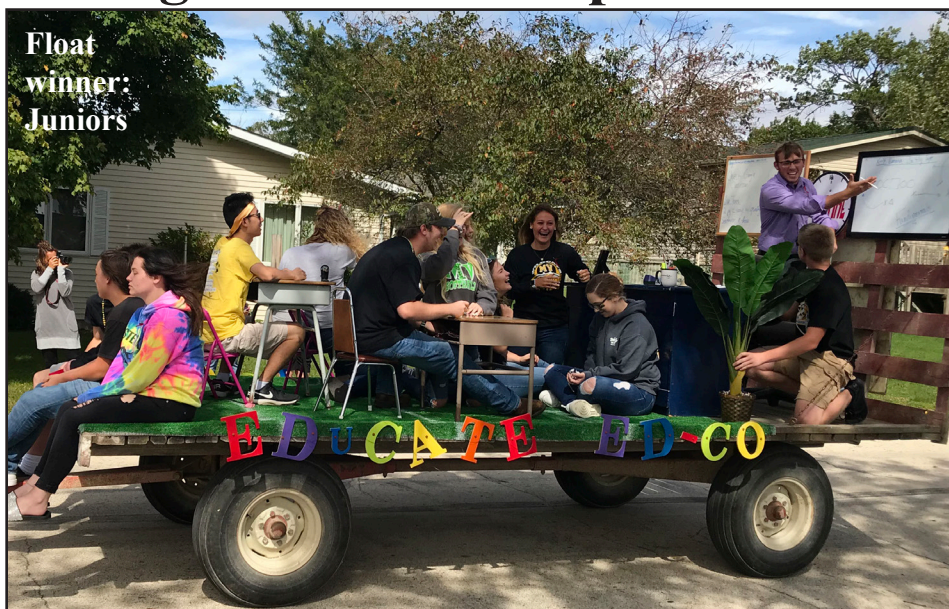
Float winner: Juniors