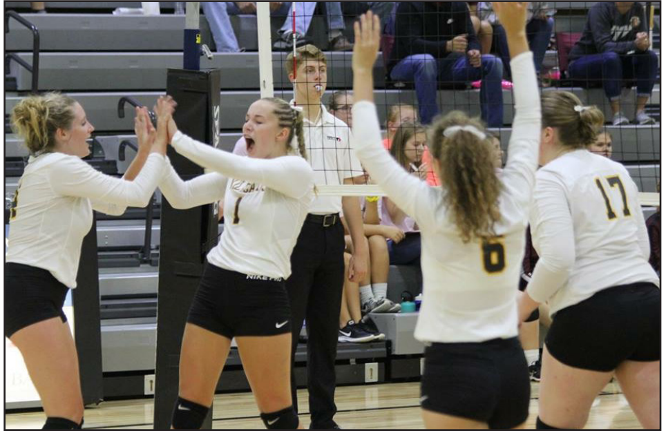
The team celebrates a point during the North Linn match Tuesday night.