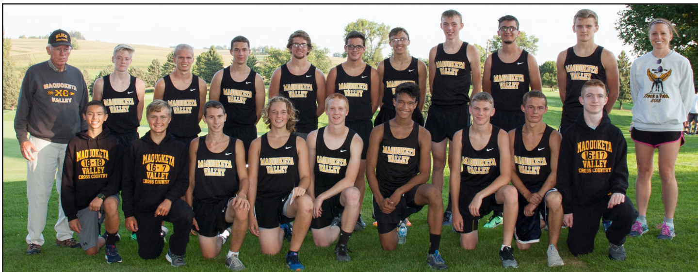
The boys cross country runners and coaches pose after the MFL Mar Mac meet last Thursday night. The boys won the varsity meet.