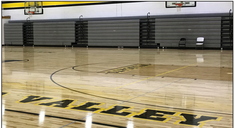
The high school gym is now open for business! The bleachers have been installed. A few details including the trim and some paint work need to be completed still.

The Wildcats traveled to Easton Valley last night to start off the regular season. Details will be in next week's issue.