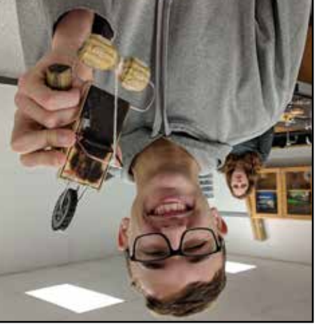
—compiled by Lydia Helle Comedy Corner