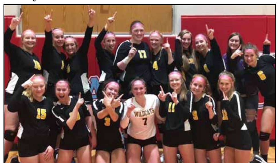
The Wildcats earned a top finish in the West Division of the conference with their win over East Buchanan Tuesday night. Lisbon won the East Division.