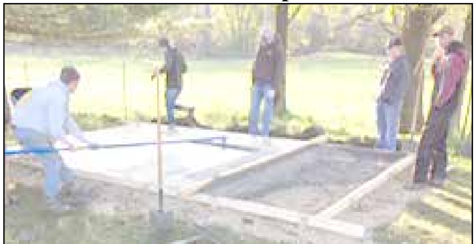
The weather cooperated Thursday for the Advanced Construction class to work at a job site north of Manchester and pour a 10' x 16' concrete slab. The next part of the project will be to build the shed, then transport and anchor it to the foundation.