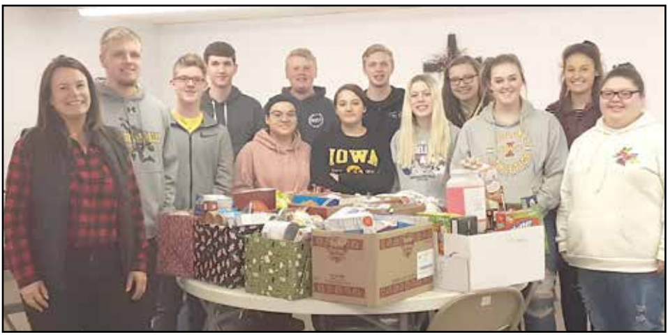
Congratulations to the Management class for sponsoring the food drive to include the community raising over $200 and 400 items to stock the Hopkinton food pantry for the long winter ahead. It was amazing to see the bare shelves be filled up with your generosity.