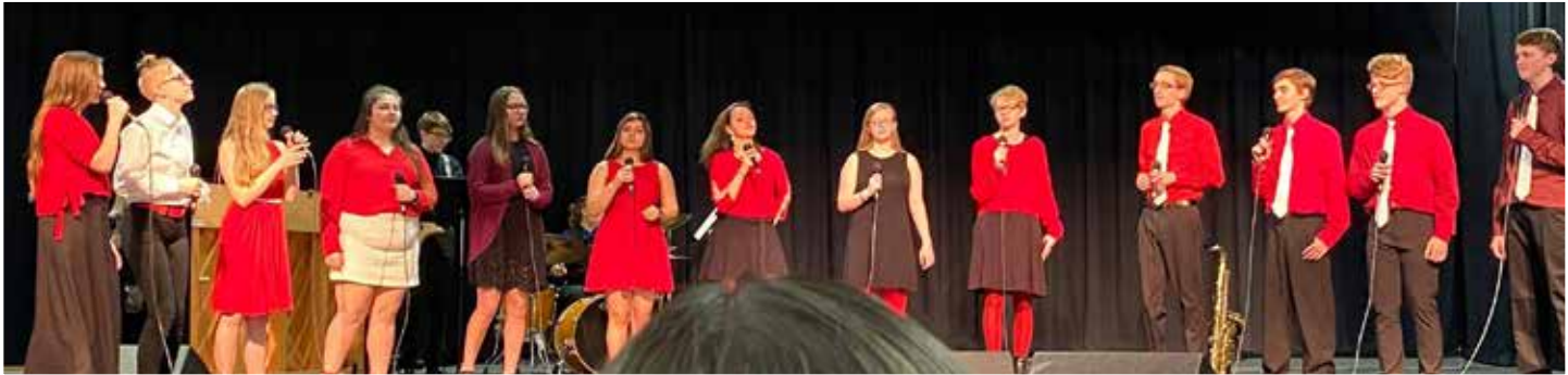
MV hosted a State Iowa High School Music Association Jazz Festival Monday night. Smooth Harmony and Jazz Xpress both earned Division I ratings.