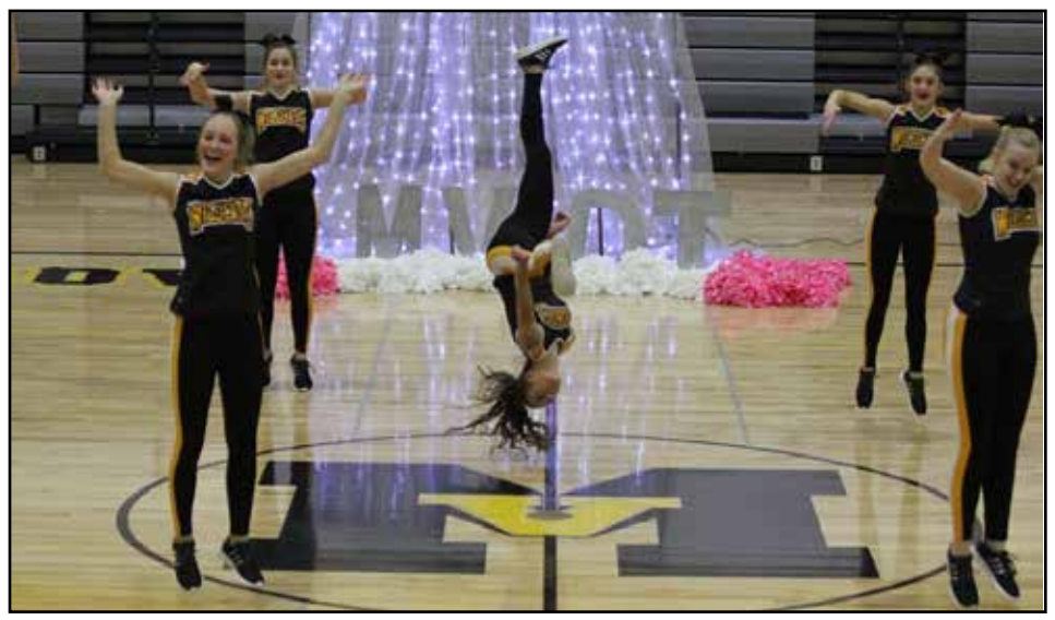
The MVDT hosted its annual Strut Your Stuff Mar. 7 to showcase their dances throughout the season. Youth dancers also performed.