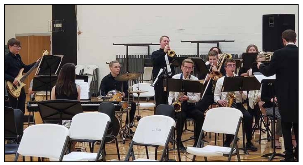
The jazz band performs at the annual Parade of Bands concert Mar. 3. The jazz band also competed at the UNI Tallcorn Festival in February and NEIBA jazz Mar. 7. The jazz band brought home a third place trophy from NEIBA jazz.