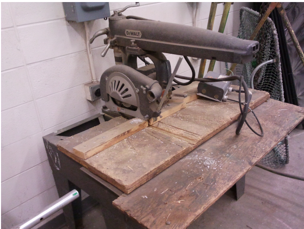
Dewalt Radial Arm Saw 2 hp 115/230 1 Phase