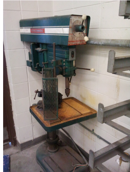
Powermatic Drill Press 1 1/2 hp 115/230 1 Phase