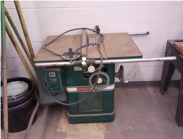
Powermatic Drill Saw 115/230 1 Phase

We reserve the right to reject any or all bids.