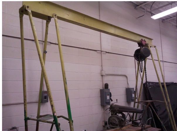
Hoist 2 ton Frame