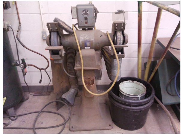
Grinder 2 hp 115/230 1 Phase