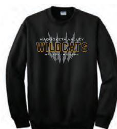
FLEECE CREW BLACK OR CHARCOAL $22