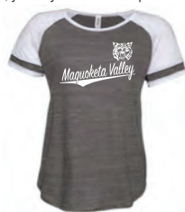
RAGLAN TEE DARK HEATHER $18