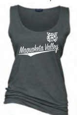
JR FIT TANK DARK HEATHER $14

These three tops run small, you may want to order up a size or find us at a vendor show to try on.