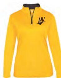
QUARTER ZIP GOLD $27