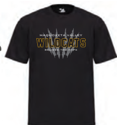
PERFORMANCE T-SHIRT BLACK OR CHARCOAL $18