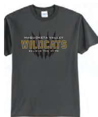
T-SHIRT BLACK OR CHARCOAL $12