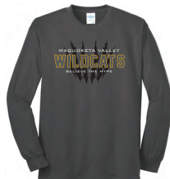
LONG SLEEVE T-SHIRT BLACK OR CHARCOAL $16