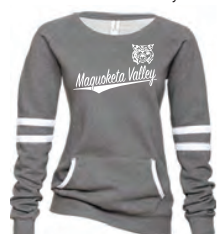
VARSITY FLEECE DARK HEATHER $26