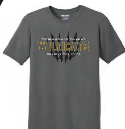
"COTTON" PERFORMANCE BLACK OR CHARCOAL $15