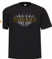
PERFORMANCE T BLACK OR CHARCOAL $16