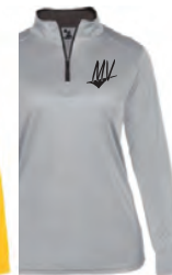
QUARTER ZIP SILVER $27