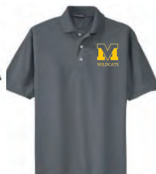
PERFORMANCE POLO STEEL GRAY $25