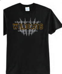
T-SHIRT BLACK OR CHARCOAL $12