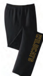
FLEECE PANTS BLACK $25