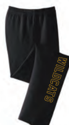
PERFORMANCE PANTS BLACK $30