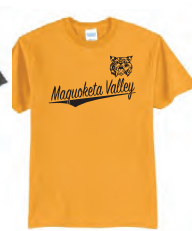
RETRO T-SHIRT GOLD $12