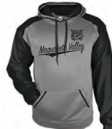
PERFORMANCE HOODY SPORT HEATHER/BLACK $35