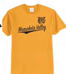
RETRO T-SHIRT GOLD $12