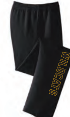
ATHLETIC PANTS FLEECE $21 PERFORMANCE $26