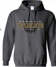
HOODY BLACK OR CHARCOAL $21