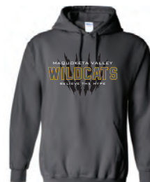
FLEECE HOODY BLACK OR CHARCOAL $25