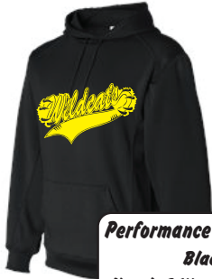
Performance Sweatshirt Black Youth S-XL, Adult S-2XL Youth $25, S-XL Adult $27 2XL-5XL $31