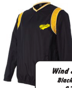
Wind Jacket Black/Gold S-2XL $35