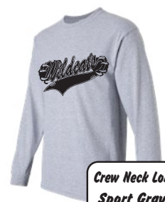
Crew Neck Long Sleeve T-Shirt Sport Gray, Black, Gold Youth S-XL, Adult S-XL, 2XL- 5XL Youth $12, S-XL Adult $16 2XL-5XL $18