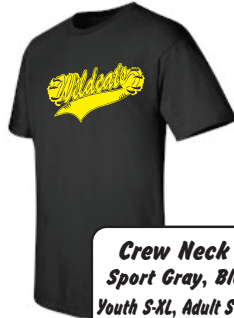
Crew Neck T-Shirt Sport Gray, Black, Gold Youth S-XL, Adult S-XL, 2XL- 5XL Youth $10, S-XL Adult $12 2XL-5XL $14