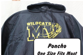
Poncho One Size Fits Most $25