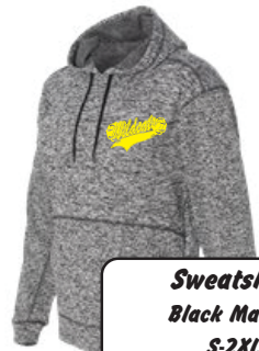
Sweatshirt Black Marble S-2XL S-XL Adult $28 2XL $32