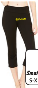
Capri Pants Black Small - 2XL, Small - 2XL Tall S-XL Adult $17, 2XL $19