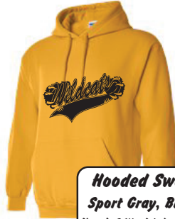
Hooded Sweatshirt Sport Gray, Black, Gold Youth S-XL, Adult S-XL, 2XL- 5XL Youth $16, S-XL Adult $21 2XL-5XL $25