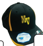
Hat Black and Gold S/M, L/XL $15