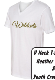
V Neck T-Shirt w/Glitter Logo Heather Gray, White, Black S-2XL - $15 Youth Crew - Black, Gold - $12