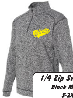
1/4 Zip Sweatshirt Black Marble S-2XL S-XL Adult $30 2XL $34