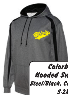
Colorblock Hooded Sweatshirt Steel/Black, Carbon/White S-2XL S-XL Adult $35 2XL $38