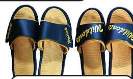
Slide Sandal Black/Gold Sm, Med, Lg, XL $15