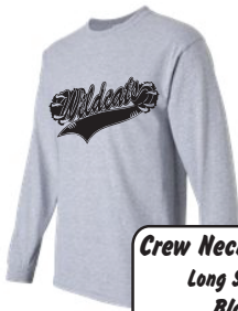
Crew Neck Performance Long Sleeve T-Shirt Black, Gold Youth S-XL, Adult S-XL, 2XL- 5XL Youth $18, S-XL Adult $21 2XL-5XL $24