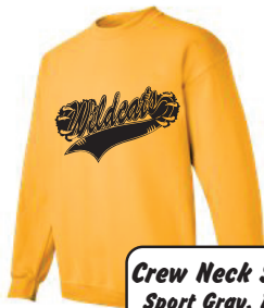
Crew Neck Sweatshirt Sport Gray, Black, Gold Youth S-XL, Adult S-XL, 2XL- 5XL Youth $18, S-XL Adult $22 2XL-5XL $25