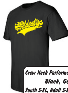
Crew Neck Performance T-Shirt Black, Gold Youth S-XL, Adult S-XL, 2XL- 5XL Youth $14, S-XL Adult $16 2XL-5XL $18