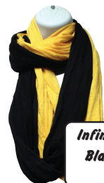
Infinity Scarf Black/Gold $10