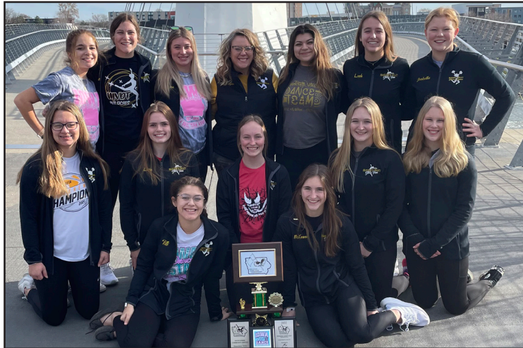
The dance team poses with the awards it was presented at state dance.

The boys will play tonight at Prince of Peace in Clinton.