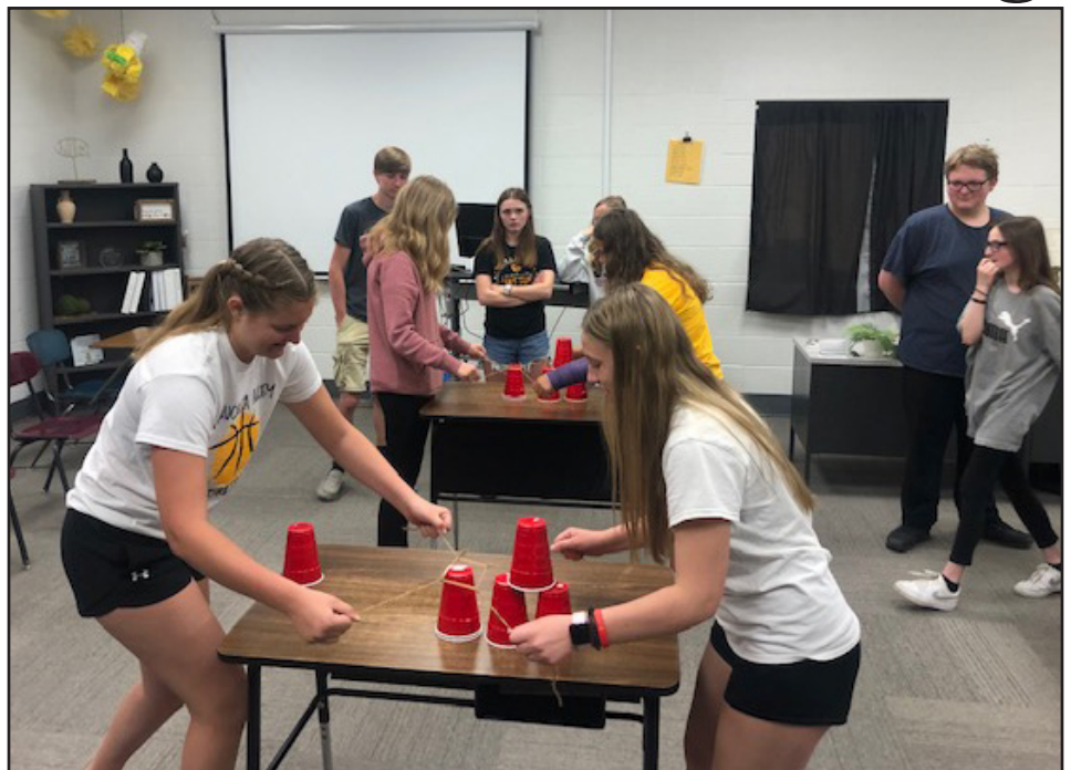
The Intro to Business class recently wrapped up a team-building project in which small groups researched, led, and then reflected upon activities designed to promote communication and team-work.