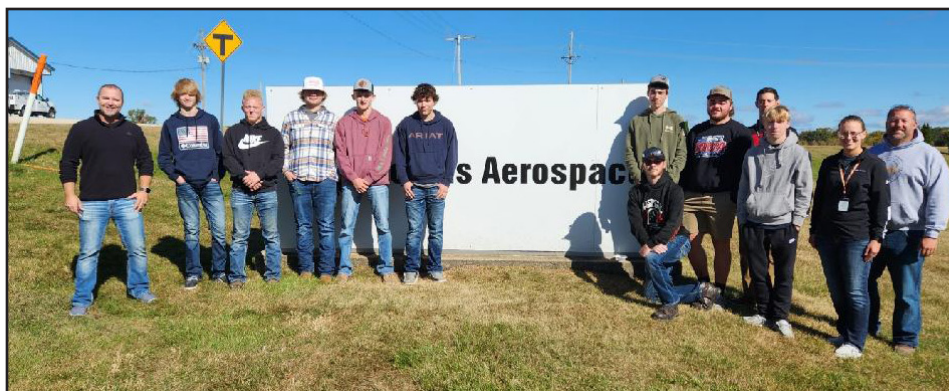
Left: MV students toured Collins Aerospace Friday. Additionally, the students toured Stanley Black & Decker and Henderson Manufacturing.