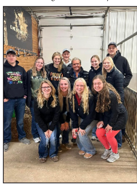
On the way to convention, FFA members toured Hummel Livestock in Cabery, Ill.

Saturday was the day to head home. Overall the students learned about the power of the blue jacket, mentoring others, managing time, how to better themselves and the agriculture industry.