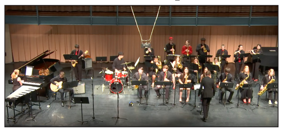
MV's jazz band competed in UNI's Tallcorn Jazz Festival last week.