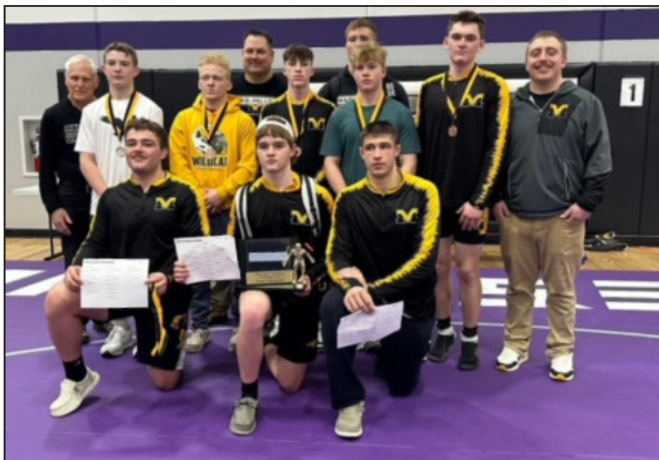
The varsity wrestlers finished in first as a team at the meet in Baxter this past weekend.

Tomorrow, the boys will travel to Wilton to compete in Districts for a chance at the State Tournament. Good luck!