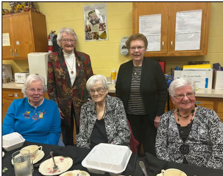
The third-level Advanced Foods class hosted an etiquette dinner Wednesday night. They planned and prepared everything necessary for this community event, including meal planning, budgeting, advertising and serving. Pictured are some guests.