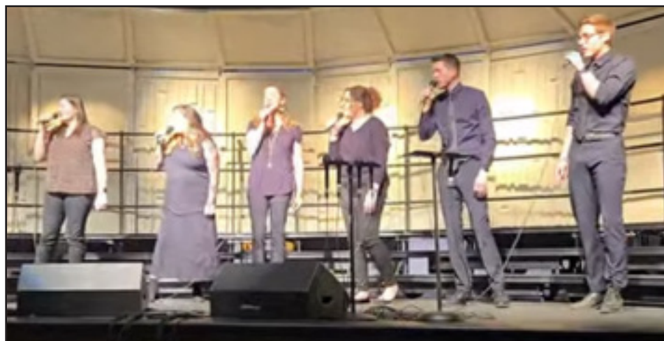
Music fans were in for great treats at MV's Got Talent Feb. 28. Along with soloists, small groups, the jazz band, and vocal jazz groups performing, a group of teachers also shared their vocal talents.