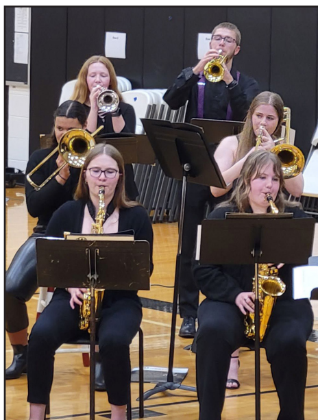
The Parade of Bands concert was held Mar. 4.