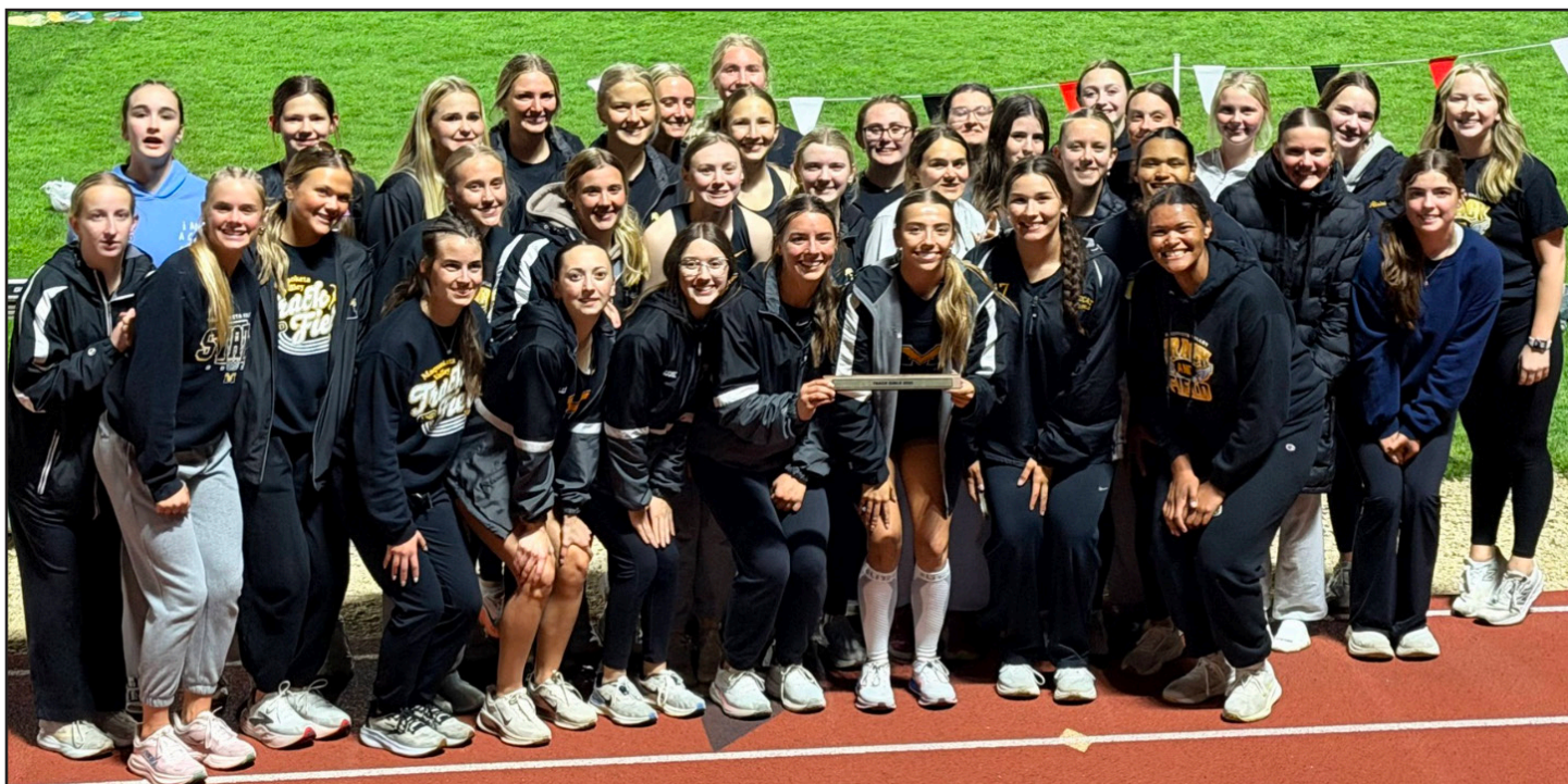
The girls track team poses at the end of the TRC meet Thursday night after earning first place at the meet.