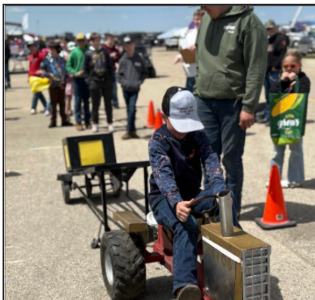
Left: FFA members helped with a pedal pull over the weekend.