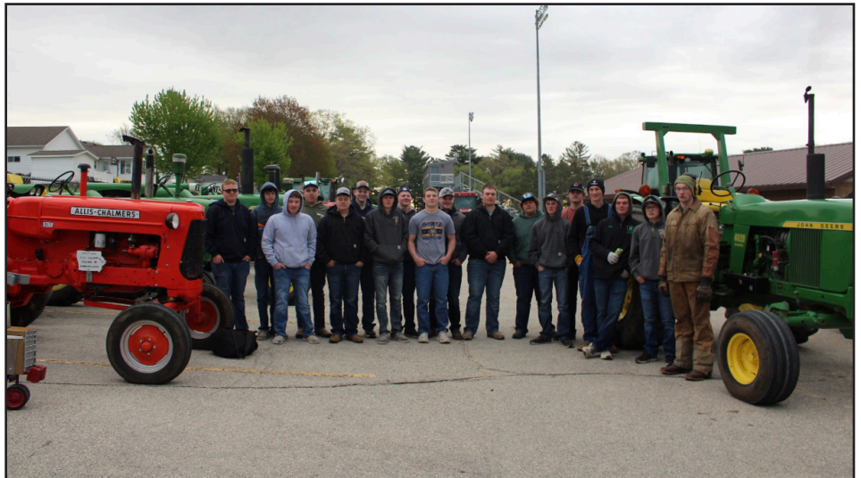
FFA members pose with some of the tractors that filled the lower parking lot Friday.

The CTE organizations hosted its annual MV Market Wednesday where they had lots of student-made goods for sale. FCCLA (FCS) had baked goodies, specialty drinks, MV apparel, and sewn items. FFA (Ag) sold plants from the greenhouse. FBLA (Business) sold items such as pots, claw clips, and stickers. Skills USA (Industrial Technology) sold wooden cutting boards, wooden bowls, games, top spinners, bird feeders, coat hangers, and more. Purchases support classroom activities and supplies.