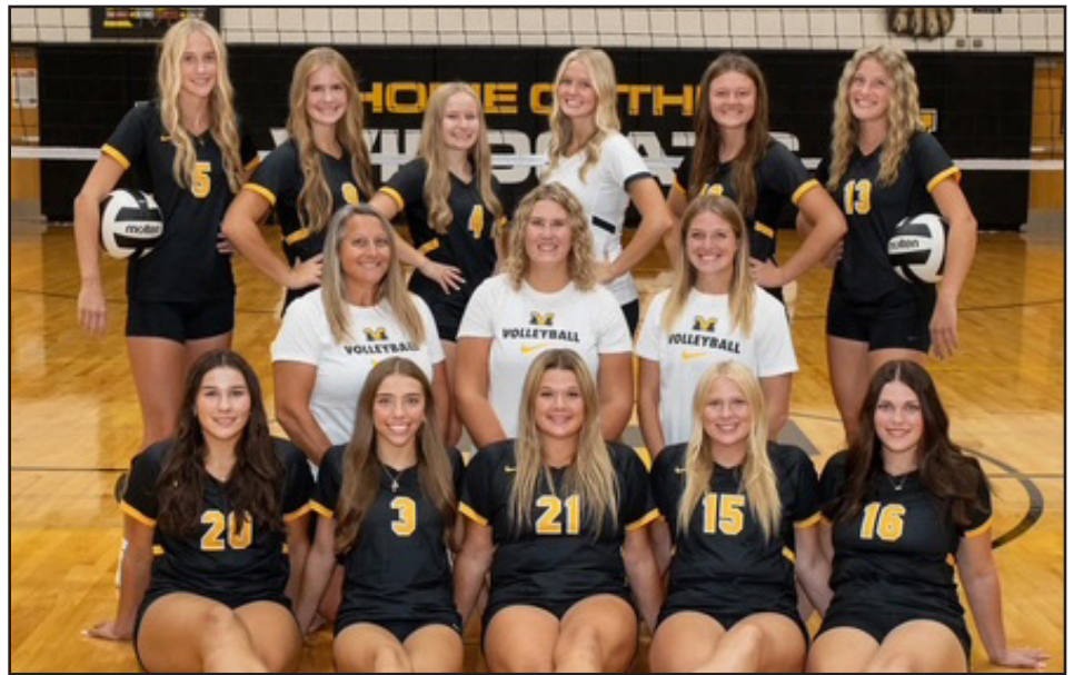
The varsity team along with the coaches.

other up after a mistake. There is always room for improvement in general areas like serve receive, and blocking. We will continue to improve these skills as the season progresses.”